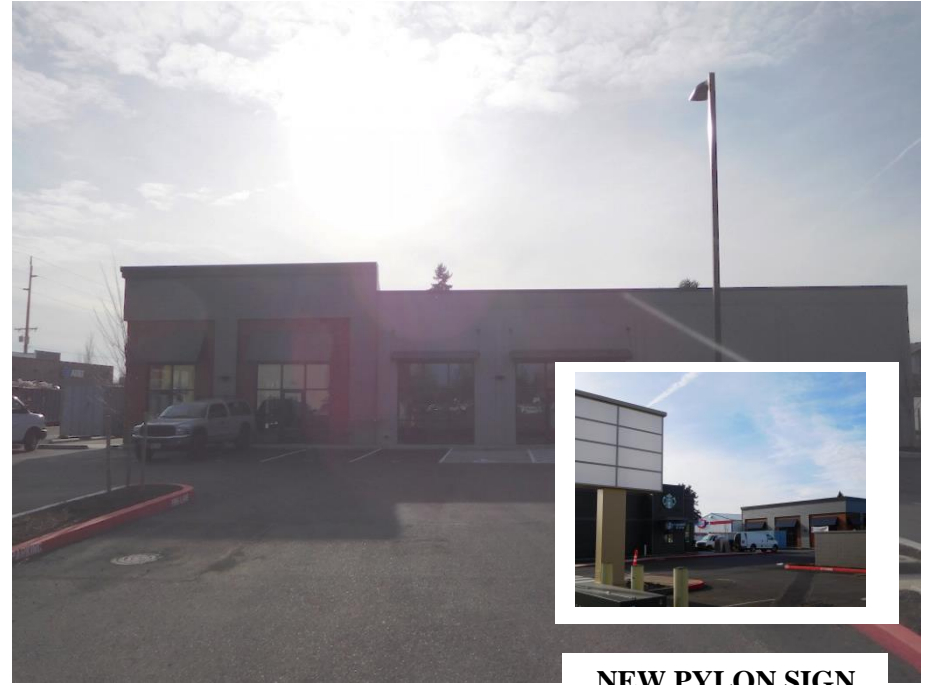
NEW PYLON SIGN