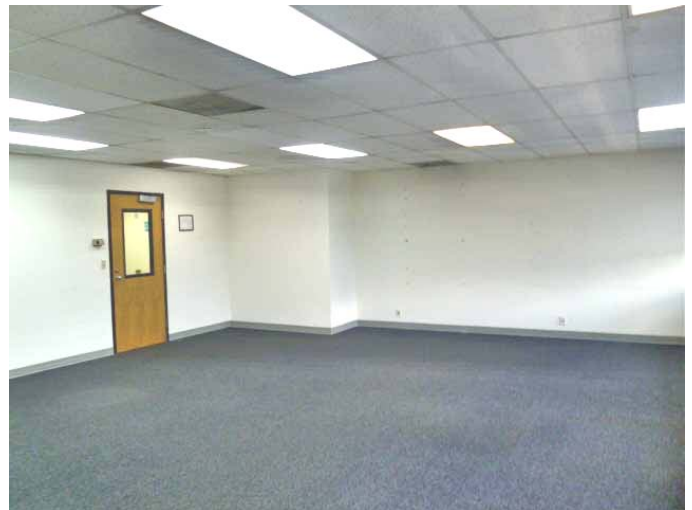
SUITE 205 (688 sq. ft.)