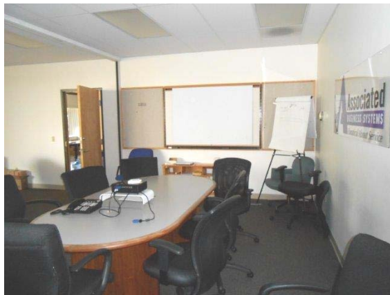
Meeting / Training Room