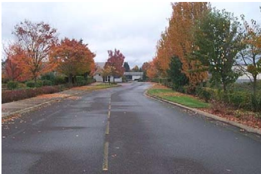
Entry Drive to Property