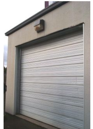
12' x 10' Overhead Door